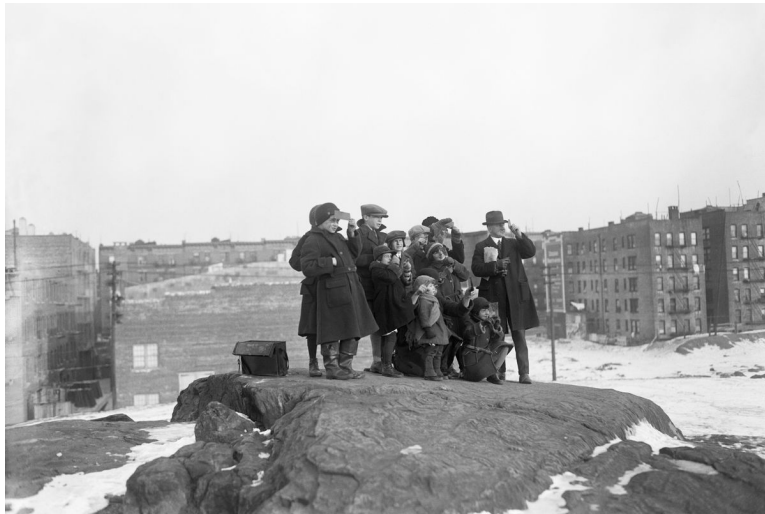
These are children watching the Solar Eclipse from a convenient spot near their homes in the Bronx in 1925.

And here are Manhattanites watching the Solar Eclipse in 2017. Have you ever seen one? (I hope you were wearing protective lenses! Scientists say even dogs should have their eyes protected.)